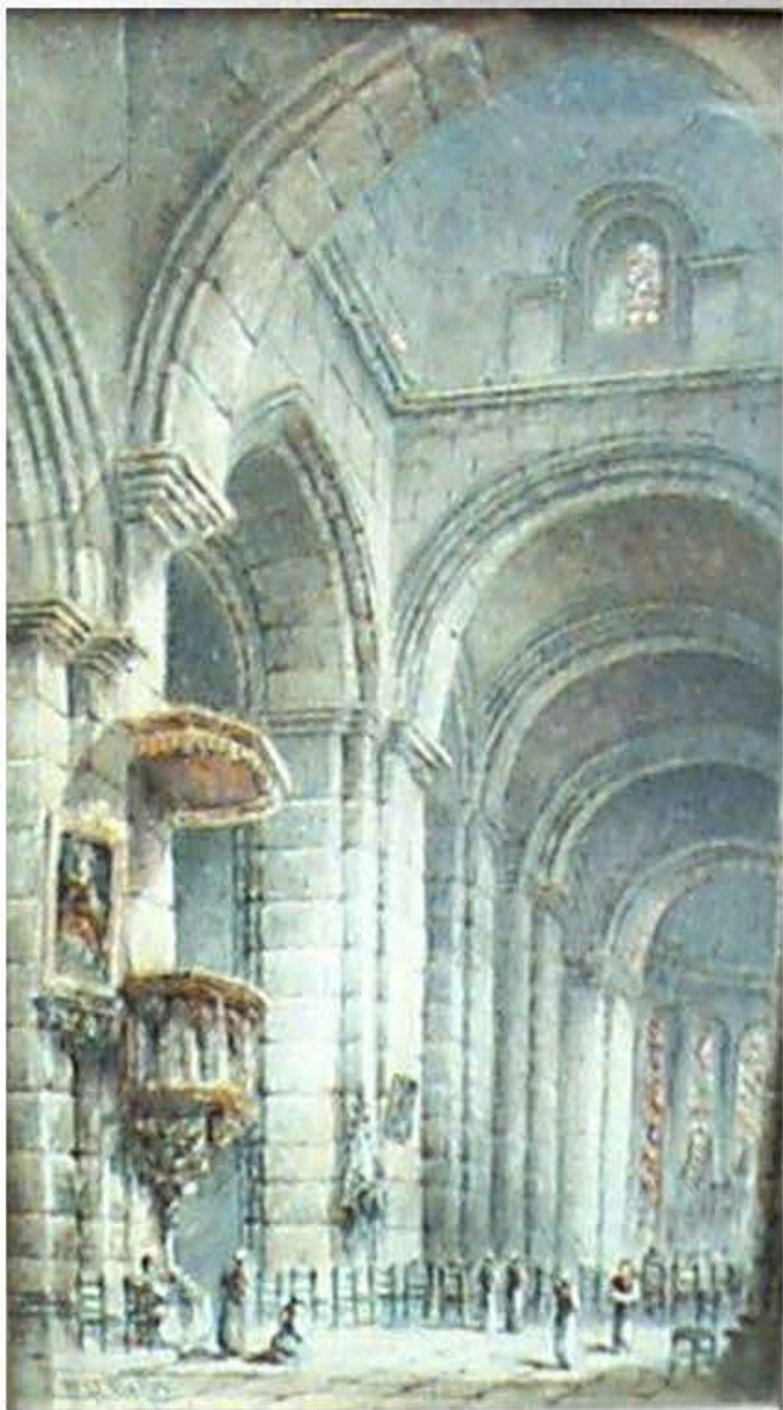
"That proves what I'm saying. You can see he's of the European school."